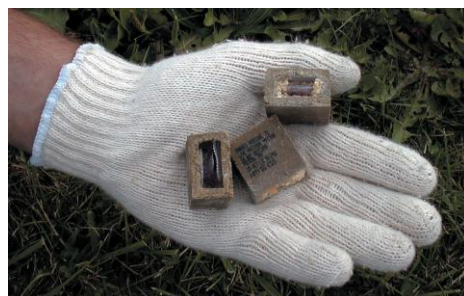
Fishmeal polymer bait

The fall baiting operation typically includes all of the counties along the entire eastern border of Ohio, along with counties in Pennsylvania and West Virginia. The purpose of the routine fall ORV baiting is to maintain the 25-mile-wide immune barrier along Ohio's borders with Pennsylvania and West Virginia. All or parts of 14 counties (Ashtabula, Belmont, Carroll, Columbiana, Cuyahoga, Geauga, Harrison, Jefferson, Lake, Mahoning, Monroe, Portage, Summit, and Trumbull) will be baited during the Fall ORV Program. Approximately 772,686 fish meal polymer baits will be distributed by hand, by helicopter and by fixed-wing aircraft throughout these counties.